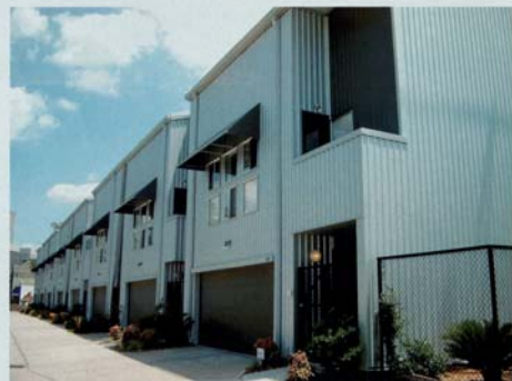
MHC - Mar/Apr 04 37

said, "This saves electricity bills in the hotter climates. The UL-4 rating given to the roofs allows the customer to receive anywhere from 25%-40% savings off of homeowner insurance, particularly in hail prone areas of the country. The Galvalume also gives the industrial look of contemporary, cutting edge design that blends in harmony with industrial urban settings."