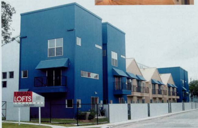
MHC - Mar/Apr 04 35