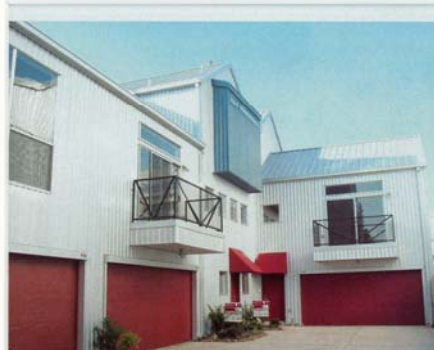
36 MHC - Mar/Apr 04